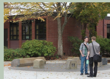
Henry Lennstrom Stone Circle

To learn more about honoring a loved one through the dedication of a named gift, please contact the Foundation office at 360.442.2130.