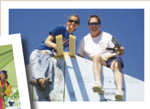
Top to bottom: LCC Student Nurses assist with Habitat for Humanity project. Red Devil Days is sponsored each spring by ASLCC. Co-curricular groups like choir provide activities beyond the classroom.