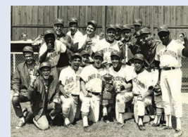
1970 Championship Baseball Team