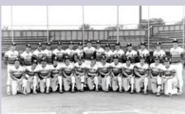
1981 Championship Men's Baseball Team