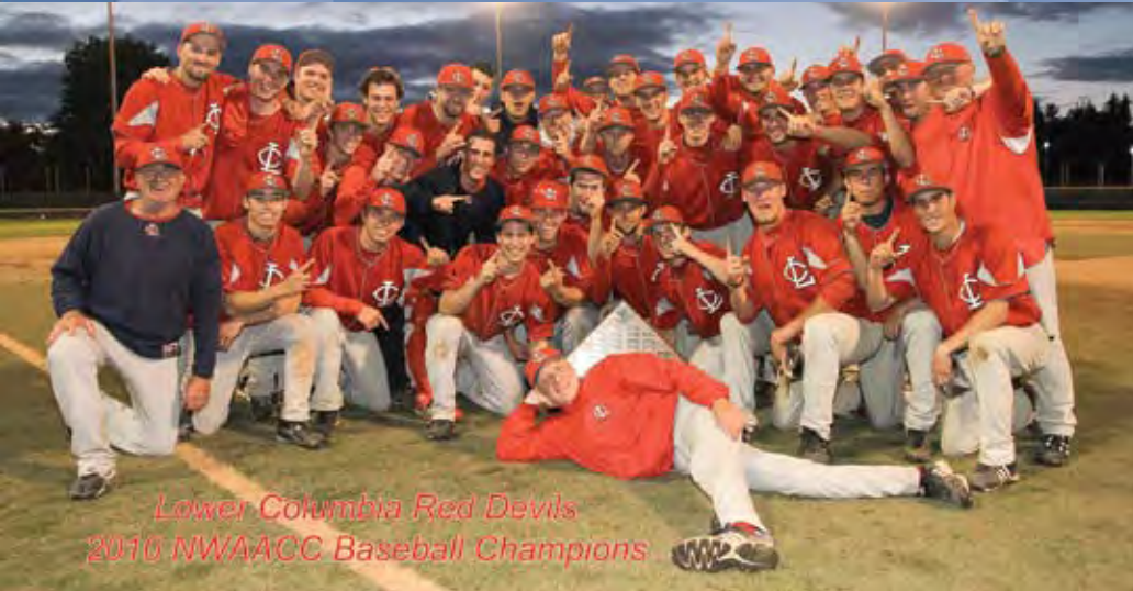
Lower Columbia Red Devils 2010 NWAACC Baseball Champions