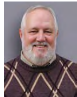
Lower Columbia College Board of Trustees, left to right: