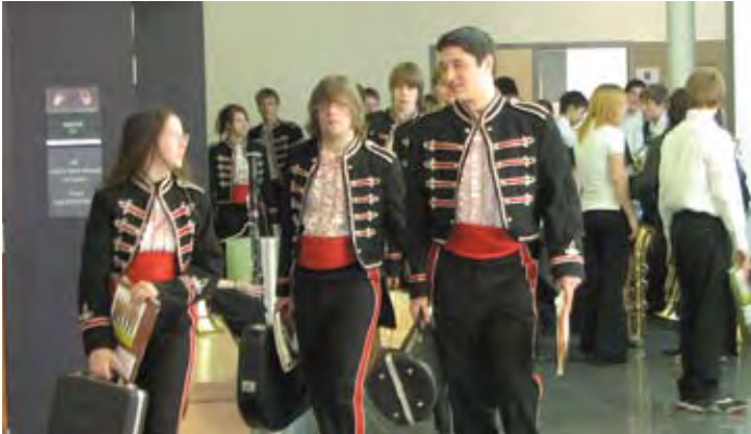
Southwest Washington high school musicians welcomed the chance to perform in the region's top venue at the Rose Center. Red Devils celebrate their NWAACC Baseball Championship.

Arts Events, Critical Life Issues, and the Black Bears Beckon New College Visitors